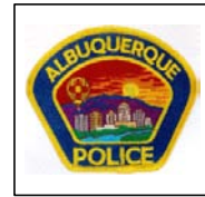
Albuquerque Police Department