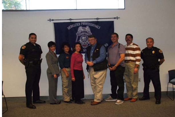
Westside Area Command Civilian Personnel

To adequately respond to the very large number of requests from the Westside Community, I continue to rely on a strategy called the "Top-Ten". The "Top-Ten" is a list of locations. The top-ten on the list generate the most calls for service at individual locations. The list is a dynamic document because it is in a constant state of adjustment. When a location is placed on the list, the Westside Command and its partners engage in problem solving to reduce the calls for service at that location. As soon as success is achieved at that location, it drops out of the "Top-Ten" to its new, lower volume of calls for service, and the list is adjusted to reflect the new ordering of locations by calls for service. From the strategy's implementation to the present, the average volume of calls that placed a location on the "Top-Ten" has decreased from more than 900 to